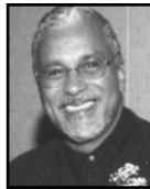
POLITICAL HEALTH ADVOCATE OF THE YEAR Donne Trotter SENATOR STATE OF ILLINOIS